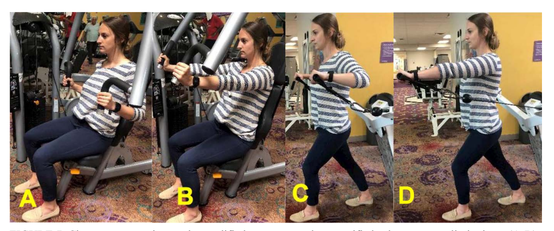
FIGURE 7. Chest press exercise can be modified to accommodate specific back movement limitations. (A-B) A version of a seated machine chest press for persons with extension intolerance (A, starting position; B, pushing motion). (C-D) An adjustable cable column version of a standing chest press exercise for persons with flexion intolerance (C, starting position; D, pushing motion).

Low back pain is a common musculoskeletal disorder affecting approximately 38% of new outpatient cardiac rehabilitation patients. The majority of LBP is considered chronic and nonspecific. Cardiac rehabilitation patients who have CNSLBP can obtain the same improvements in physical activity tolerance, physical function, and HRQoL as persons without CNSLBP. A comprehensive, individualized approach to developing exercise programs that