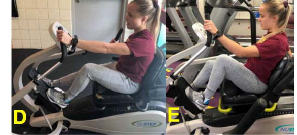
FIGURE 1. Recumbent arm/leg ergometry. (A-C) Overreaching with knee and elbow hyperextension (A) and hyperflexion (B and C) from improper seat adjustment of the recumbent arm/leg ergometer can exacerbate low back pain. (D-E) Proper positioning is demonstrated (D, starting and finish position; C, pulling motion).