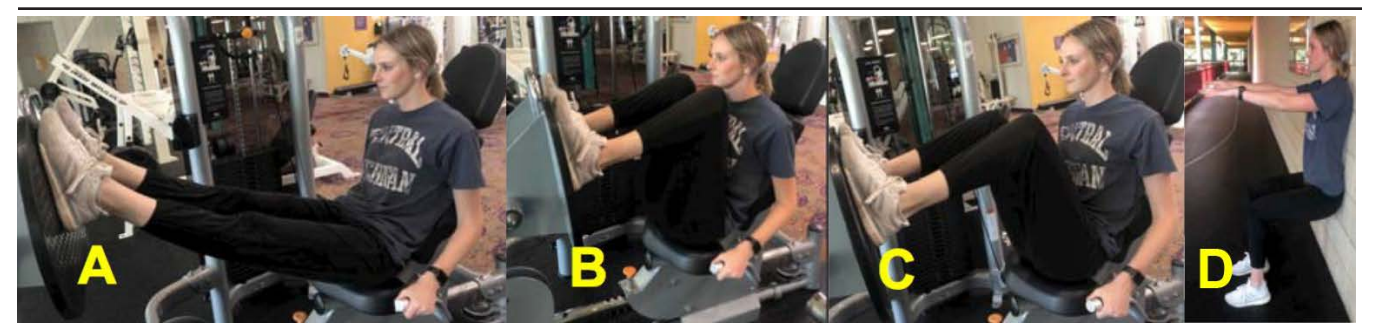
FIGURE 4. Seated leg press is a well-tolerated multi-joint lower body strength exercise option for persons with extension intolerance. Improper seat positioning can worsen back pain. (A) Overextension of the knees and overreaching during the end of the pushing phase of the leg press can exacerbate low back pain in persons with extension intolerance. (B) The knee to chest position is a form of spinal flexion which might need to be modified for persons with flexion intolerance. (C) Sitting fully against the back seat pad will ensure vertical alignment of the head, neck, back, and hips, and support a more neutral spine. An alternative can be either a supine leg press (not shown) or (D) a standing wall squat, with or without a stability ball behind the back (D, proper alignment at the bottom position). The wall squat performed with a stability ball is an alternative to the leg press for persons with flexion intolerance.

An initial training intensity that is equivalent with an RPE of 12 to 13 (out of 20) or 4 to 6 (out of 10) on the OMNI RES scale is appropriate and, if tolerated, may be progressed over time (1,3,5). Although single set RT programs