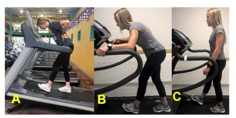
FIGURE 2. Treadmill walking. (A) Pain can occur during inclined walking from compensatory trunk flexion in a person with flexion intolerance. (B) Pain during prolonged walking and compensatory trunk flexion in a person with extension intolerance. (C) Walking on a level surface may be best tolerated by persons with flexion intolerance. Those with extension intolerance may do better with some incline or, if necessary, by substituting seated or recumbent exercises for treadmill walking.

FIGURE 1. Recumbent arm/leg ergometry. (A-C) Overreaching with knee and elbow hyperextension (A) and hyperflexion (B and C) from improper seat adjustment of the recumbent arm/leg ergometer can exacerbate low back pain. (D-E) Proper positioning is demonstrated (D, starting and finish position; C, pulling motion).