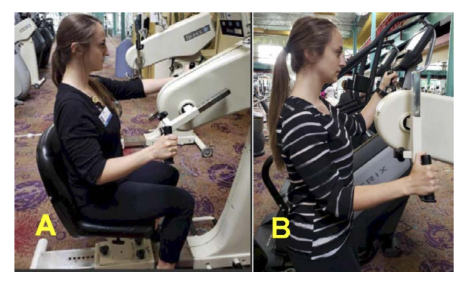
FIGURE 3. Upper body ergometry (A) can be performed seated for patients with extension intolerance, or (B) standing for patients with flexion intolerance.

FIGURE 2. Treadmill walking. (A) Pain can occur during inclined walking from compensatory trunk flexion in a person with flexion intolerance. (B) Pain during prolonged walking and compensatory trunk flexion in a person with extension intolerance. (C) Walking on a level surface may be best tolerated by persons with flexion intolerance. Those with extension intolerance may do better with some incline or, if necessary, by substituting seated or recumbent exercises for treadmill walking.